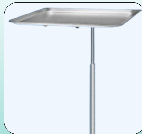
Instrument Tray (Optional)