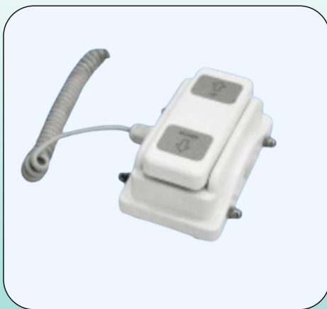
Foot Switch (Optional)